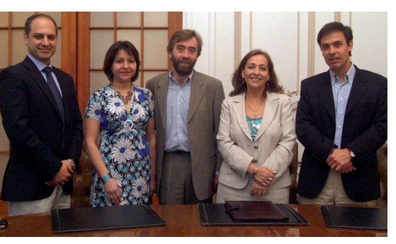
SSMOCC and GS1 Chile signing the collaboration agreement

The Servicio de Salud Metropolitano Occidente [SSMOCC -Western Metropolitan Healthcare Department] has embarked upon an ambitious process to modernise administrative and clinical management. It will implement GS1 Standards to monitor stock and to enable traceability of drugs and medical devices. This is "an important step toward quality and safety for patients" according to the responsible parties.